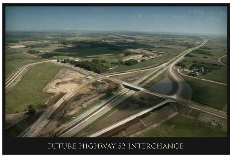
FUTURE HIGHWAY 52 INTERCHANGE

ELK RUN IS LOCATED ON HIGHWAY 52, AT THE ELK FARM, A LOCAL LANDMARK. THE ELK HERD IS COMMONLY SEEN FROM HIGHWAY 52 AS PEOPLE TRAVEL BETWEEN ROCHESTER AND THE TWIN CITIES. THE MINNESOTA DEPARTMENT OF TRANSPORTATION HAS PLANNED AND DESIGNED A NEW HIGHWAY INTERCHANGE AT ELK RUN. THE NEW INTERCHANGE WILL SERVICE PINE ISLAND AND THE IMMEDIATE AREA.