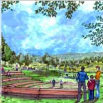
HEALTHY LIVING COMMUNITY